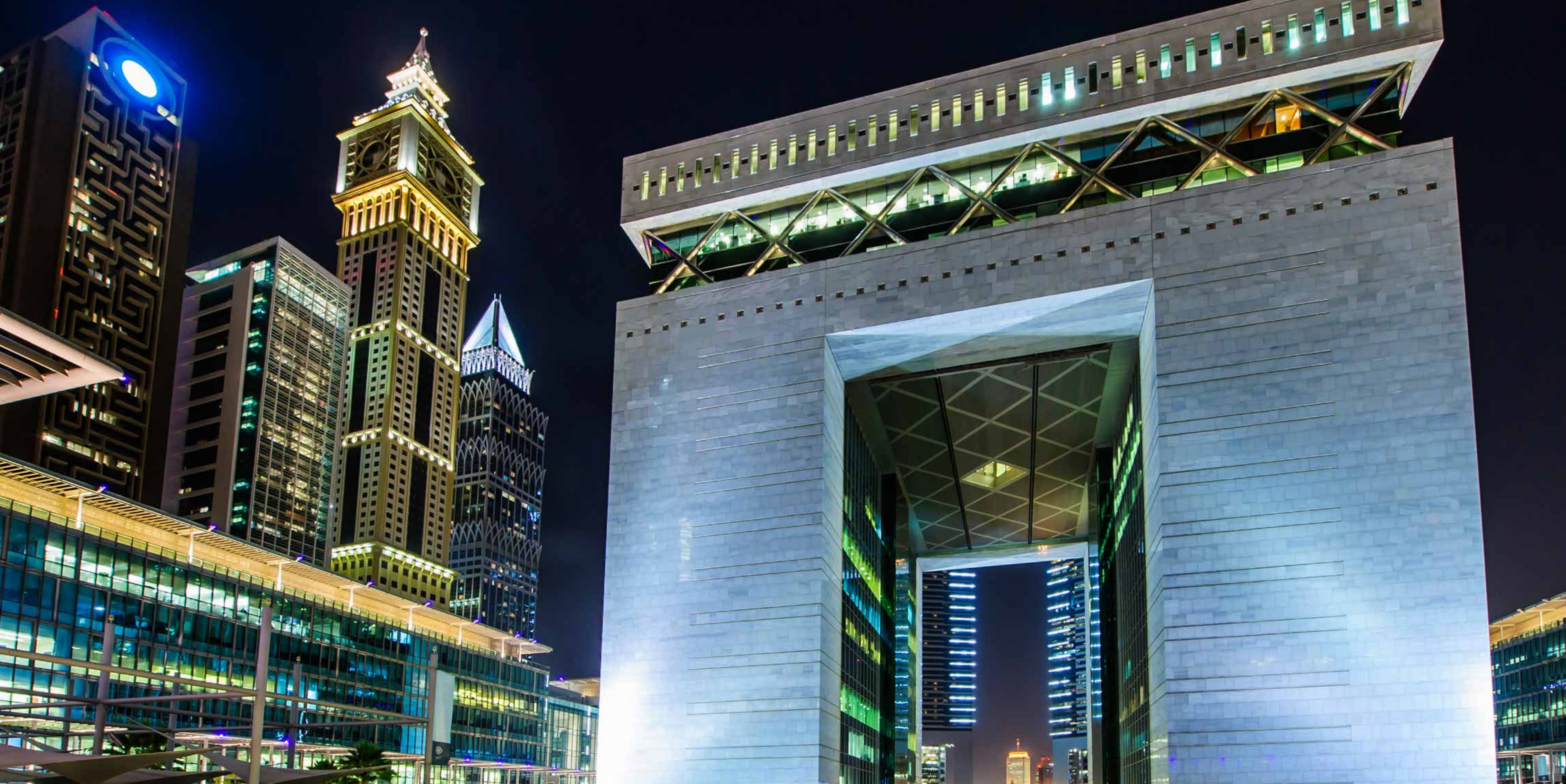
The Dubai World Trade Centre and the Dubai International Financial Centre – the financial capital of the Middle East – are just around the corner.