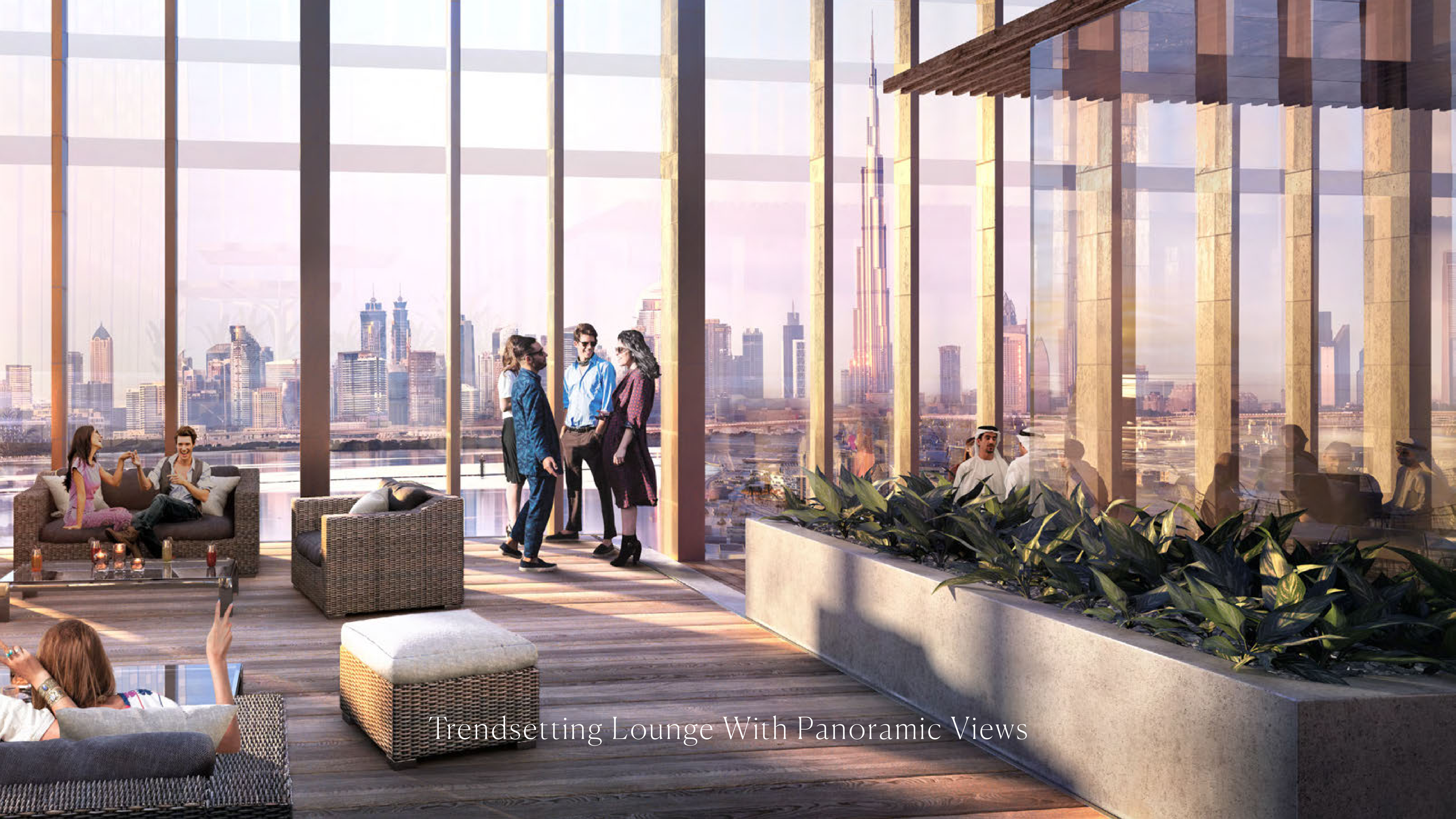
Trendsetting Lounge With Panoramic Views