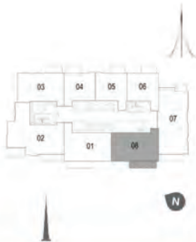
TOWER 1 2 BEDROOM W/ TERRACE UNIT 08/ LEVEL 2-17