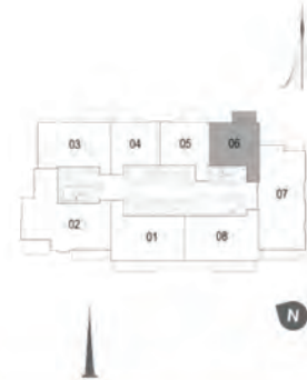
TOWER 1 1 BEDROOM W/ TERRACE UNIT 06/ LEVEL 2-17