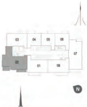
TOWER 1 3 BEDROOM W/ TERRACE UNIT 02/ LEVEL 19-34