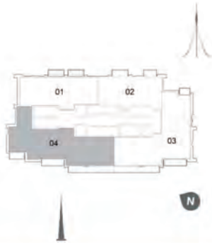
TOWER 1 4 BEDROOM W/ TERRACE UNIT 04/ LEVEL 35-36