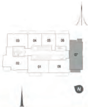
TOWER 1 3 BEDROOM W/ TERRACE UNIT 07/ LEVEL 2-17