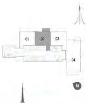
TOWER 1 1 BEDROOM W/ TERRACE UNIT 02/ LEVEL P03