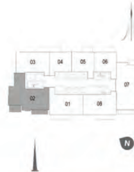
TOWER 1 3 BEDROOM W/ TERRACE UNIT 02/ LEVEL 2-17