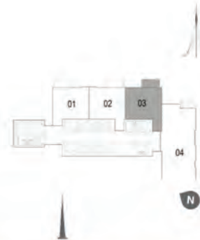
TOWER 1 1 BEDROOM W/ TERRACE UNIT 03/ LEVEL P03