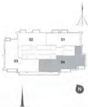
TOWER 2 4 BEDROOM W/ TERRACE UNIT 04/ LEVEL 29-30