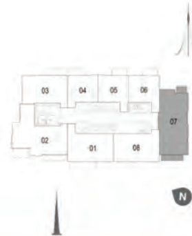
TOWER 1 3 BEDROOM W/ TERRACE UNIT 07 LEVEL 19-34