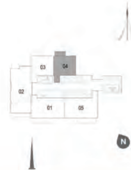
TOWER 2 1 BEDROOM W/ TERRACE UNIT 04/ LEVEL P02