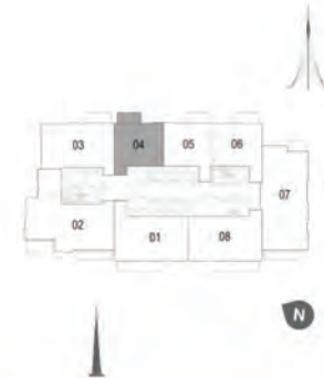
TOWER 1 1 BEDROOM W/ TERRACE UNIT 04/ LEVEL 19-34