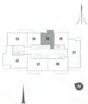
TOWER 1 1 BEDROOM W/ TERRACE UNIT 05/ LEVEL 2-17